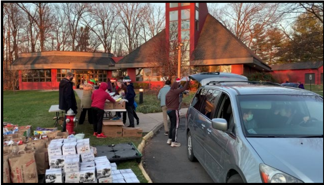
Each Tuesday between 100-200 families receive groceries served by volunteers from our greater community who give selflessly of their time and energy to help person who live with food insecurity.