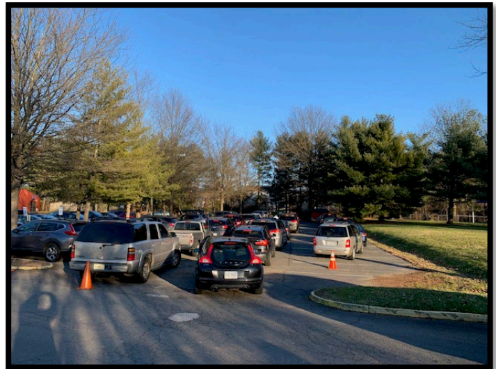
Autos line up 3 across to make room for everyone at Tuesday's food distribution

For what happened in 2021 at CoF ... and what didn't!