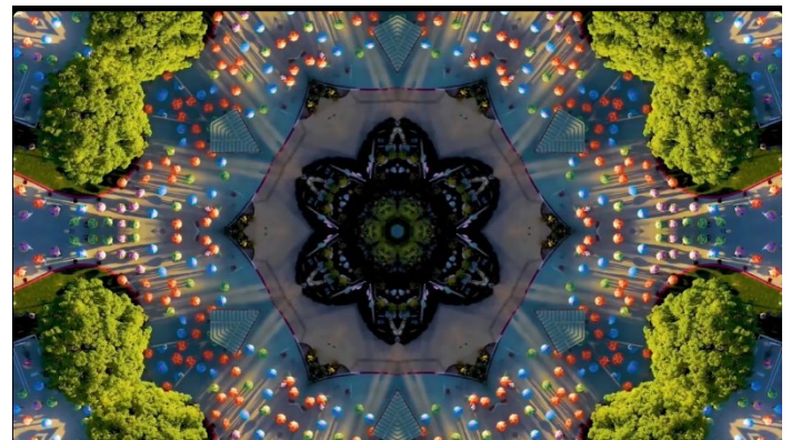
Worship April 11 2021 The Season of Easter