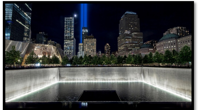
New, York City, New York